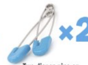
Two diaper pins or large safety pins