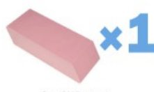
One 2½" eraser