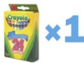
One box of 16 or 24 crayons