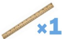
One 30-centimeter ruler, or a ruler with centimeters on one side and inches on the other