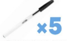
Five black or blue ballpoint pens (no gel ink); secure together with a rubber band