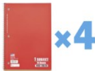
Four 70-sheet notebooks of wide- or college-ruled paper, approximately 8" x 10½"; no loose-leaf paper