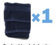
One hand towel, dark color recommended