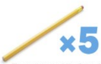
Five unsharpened No. 2 pencils with erasers; secure together with a rubber band