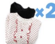
Two long- or short-sleeved gowns or sleepers (without feet)