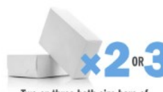
Two or three bath-size bars of gentle soap equaling 8-9 oz., any brand, in original wrapping; no mini or hotel-size bars