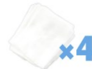
Four cloth diapers, flat fold preferred