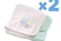
Two receiving blankets, medium-weight cotton or flannel, or crocheted or knitted with lightweight yarn, up to 52" square