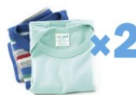
Two lightweight cotton T-shirts (no Onesies®)

Include the following items in each Baby Care Kit: