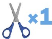
One pair of blunt scissors (safety scissors with embedded steel blades work well)