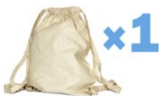
One sturdy drawstring backpack-style cloth bag, approximately 14" x 17", with shoulder straps (no standard backpacks)

Include the following items in each School Kit: