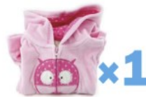
One jacket, sweater or sweatshirt with a hood, or include a baby cap